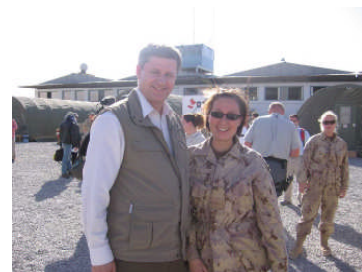
Lt. Gwen Bourque with Prime Minister Stephen Harper in Kandahar, Afghanistan